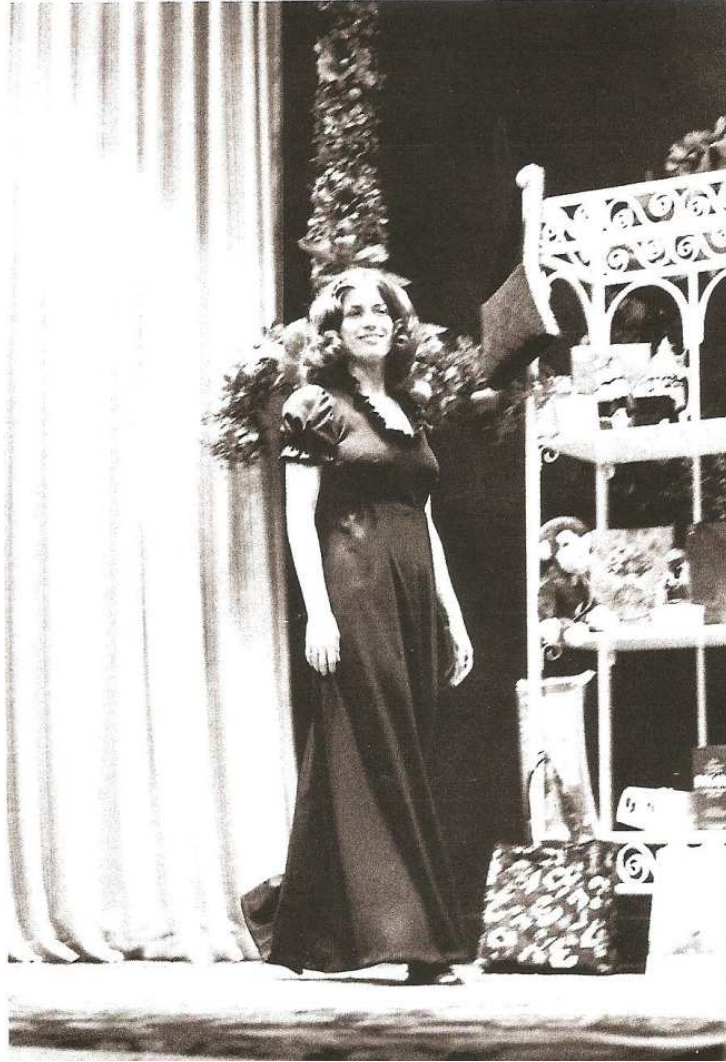
Figure 3. Teen Board Model. A Younkers' Teen Board member modeling for a fashion show at the Younkers Tea Room.